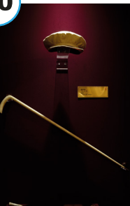
Cap and Ivory Cane belonged to Mustafa Kemal ATATÜRK