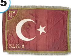
Standard of the 54th Cavalry Regiment