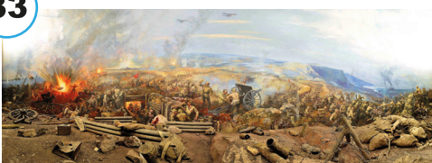
Diorama of Battle of Gallipoli