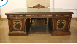
Desk belonged to Enver Pasha