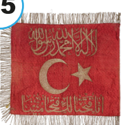
Standard presented to Mustafa Kemal ATATÜRK by the people of İzmir