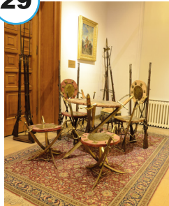
Suite of Furniture presented to Sultan Abdülhamid II by the Emperor of Austria Hungary