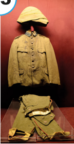
Uniform belonged to Martyr Lt.Col. Hüseyin Anı Bey