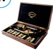
Revolver Set belonged to Sultan Abdülaziz