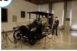
Mahmud Şevket Pasha's Official Car in which he was assassinated