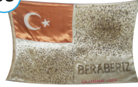
The flag created by Galatasaray High School Students with their own blood and sent to the Turkish Brigade in Korea