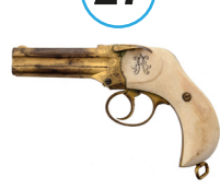
Pistol belonged to Sultan Abdülhamid II