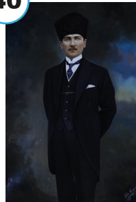
Mustafa Kemal Atatürk, Photo Français, oil painting on photograph