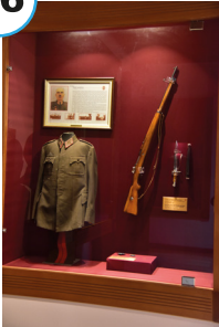
Chief of General Staff Marshal Fevzi ÇAKMAK